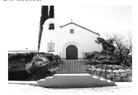
66 E. Maplewood St. Oracle, Arizona, 85623