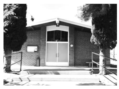
609 W. Park Pl San Manuel, Arizona, 85631