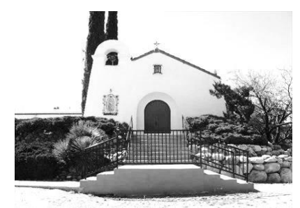
66 E. Maplewood St. Oracle, Arizona, 85623