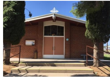
609 W. Park Pl San Manuel, Arizona, 85631