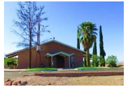
122 Church Drive Mammoth, Arizona, 85618