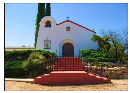
66 E. Maplewood St. Oracle, Arizona, 85623